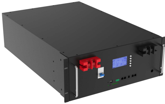
Lithium Iron Phosphate (LiFePO4) Battery